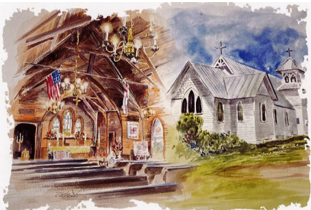
All Saints' Episcopal Church Built 1808 · Jensen Beach, Florida