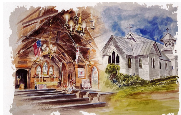
All Saints' Episcopal Church Built 1898 • Jensen Beach, Florida