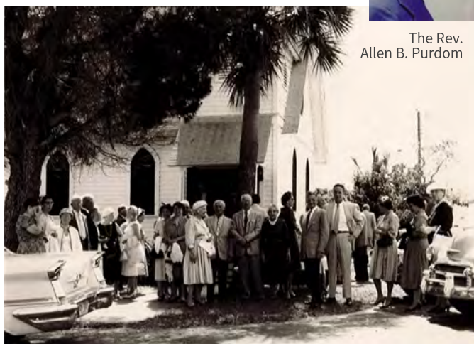
After a Sunday morning Church Service in the 1950s.