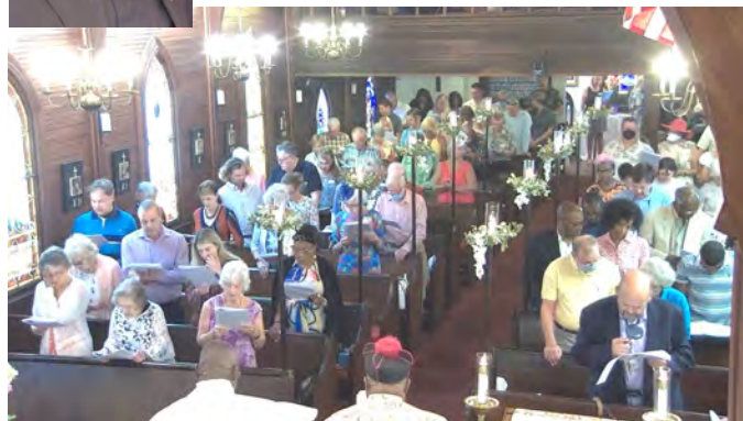
During a Sunday morning Church Service in the 2020s.

a group of people who continued to gather together for worship, service, outreach,